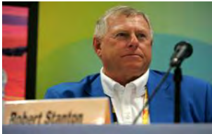
WBSC Director of Umpires