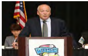
WBSC President, Softball